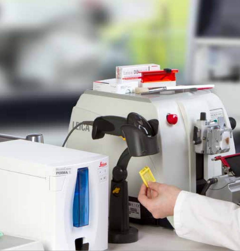
Organized – Increase workflow efficiency