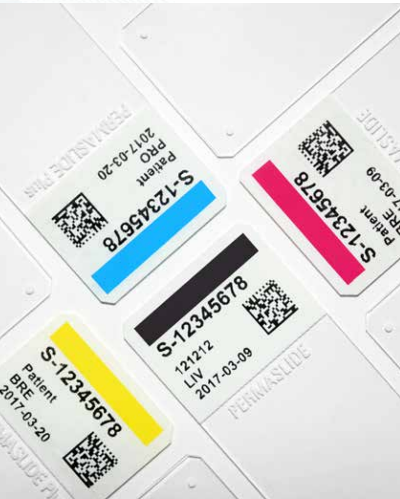
Quality – Validated slides provide consistent thermal prints