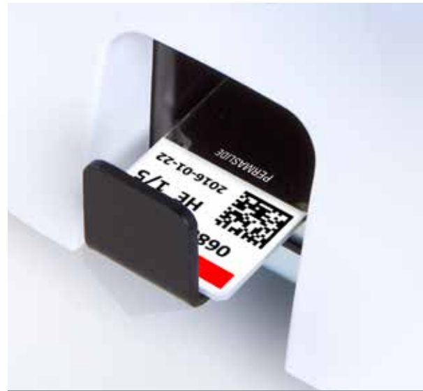
Quality – easy-to-read imprints and barcodes