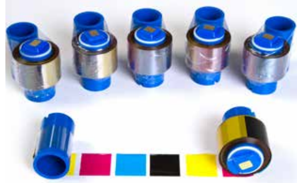
Flexible - Multi-colored ribbons